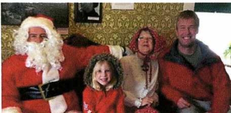
Christmas at Cozens

All of our accomplishments couldn't have happened without your support, the more than 4,000 hours of volunteer time, and the generous contributions of funds, food, and services from our community supporters.