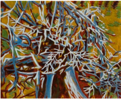
[1942] 24 x 30"