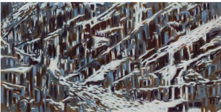
[1946] 24 x 48"