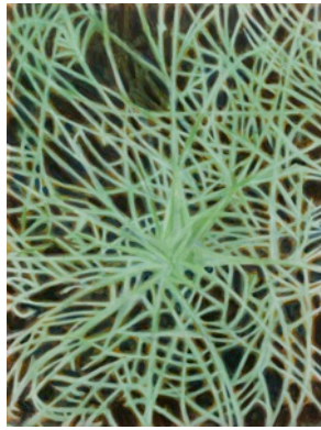
[1932] 24 x 18"