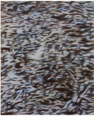
[1934] 24 x 20"