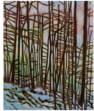
[1923] 24 x 20"