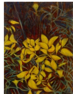
[1997] 24 x 18"