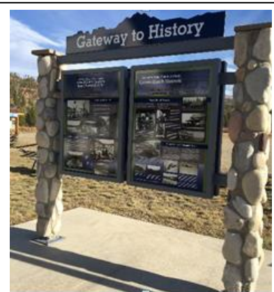
The "Gateway to History" sign at Cozens Ranch Museum in Fraser.